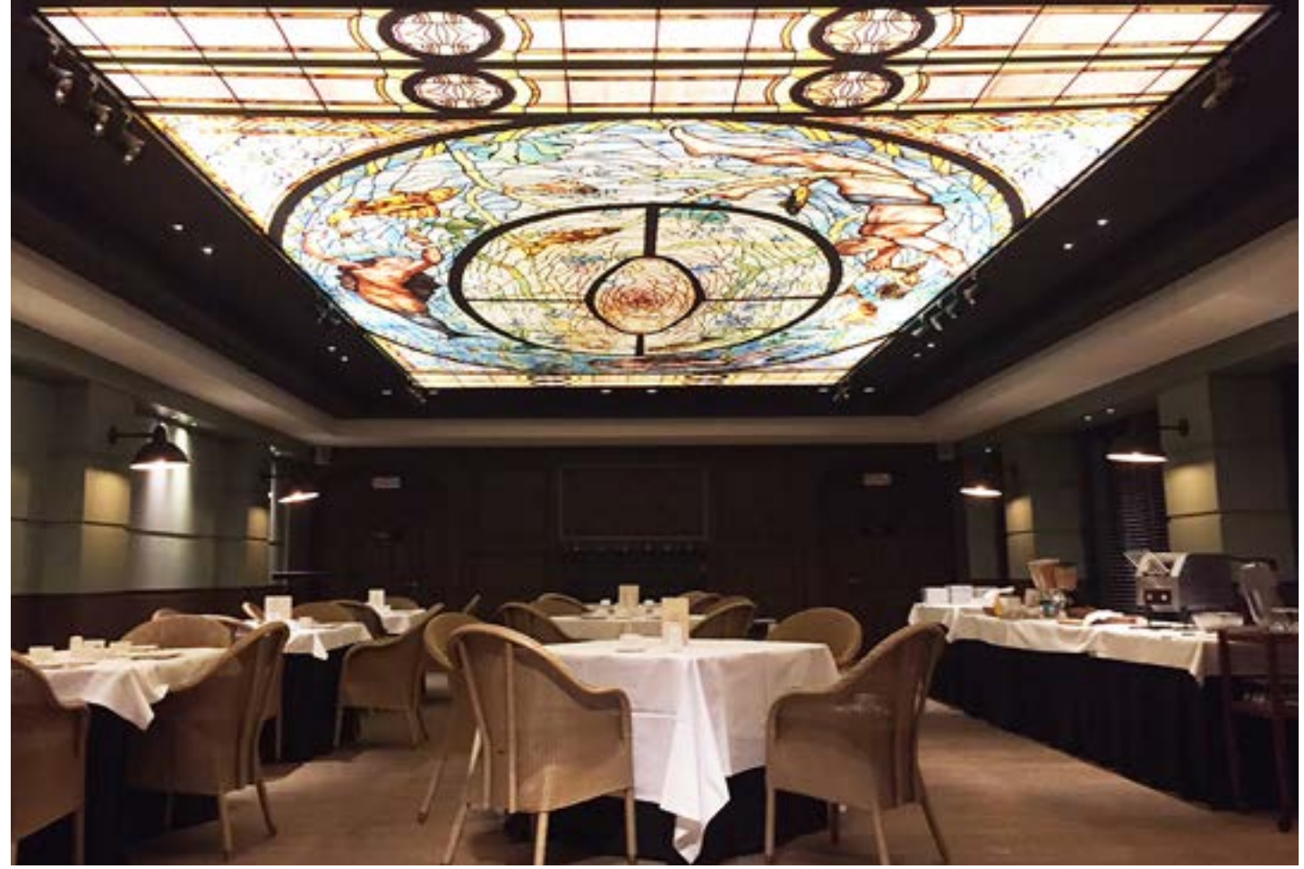
Restaurant - Backlit printed covering - Belgium - Application : MONAVISA