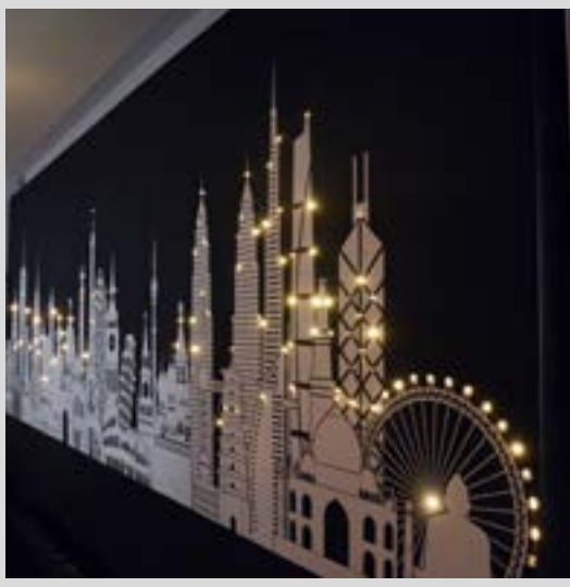
Printed wall with integrated optical fiber - France Application : CLIPSO PRODUCTION

Dream under the stars with the optical fibers embedded in our fabrics! On walls or ceilings, you create a unique atmosphere that makes you dream.