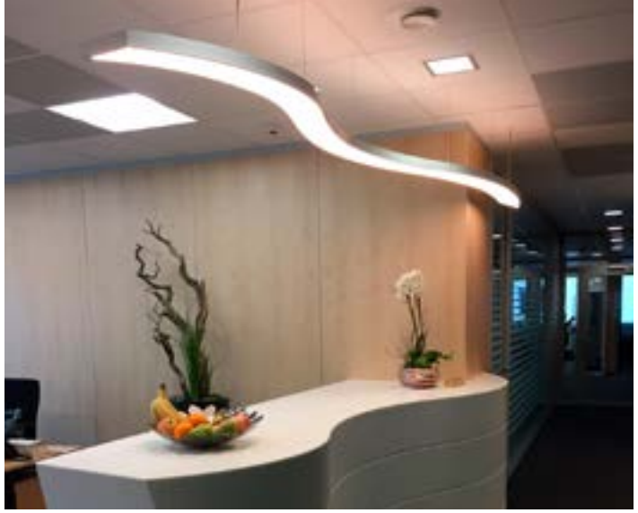
Backlit aluminum stuctures - Light Fixture - Switzerland Application : Linsi-tech