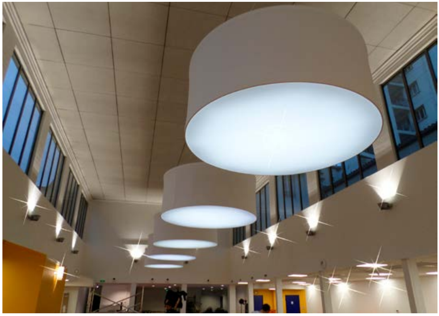
Shopping mall - XXL light fixtures in aluminum structure - Backlit coverings - France - Application : SPIDER DESIGN