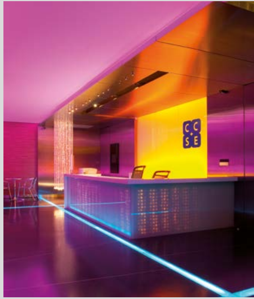
Reception desk - Backlit RGB coverings - Thailand - Application : CCSE