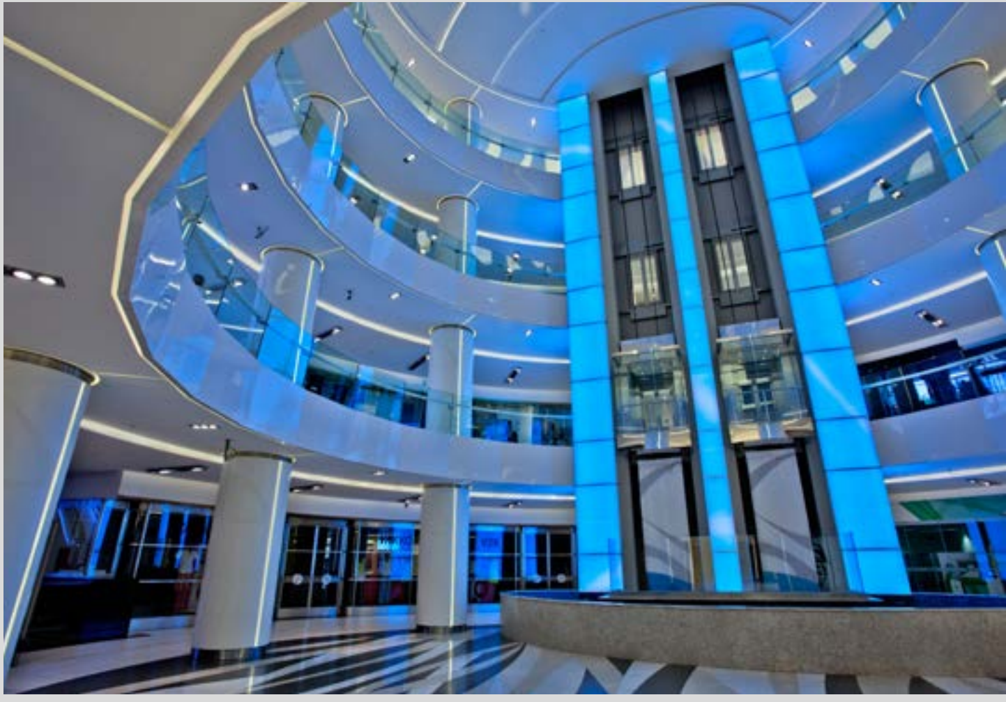
Shopping mall Akmerkez - Backlit covering - Turkey - Architect : Filiz Yilmaz - Application : TTI Elektrik Elektronik