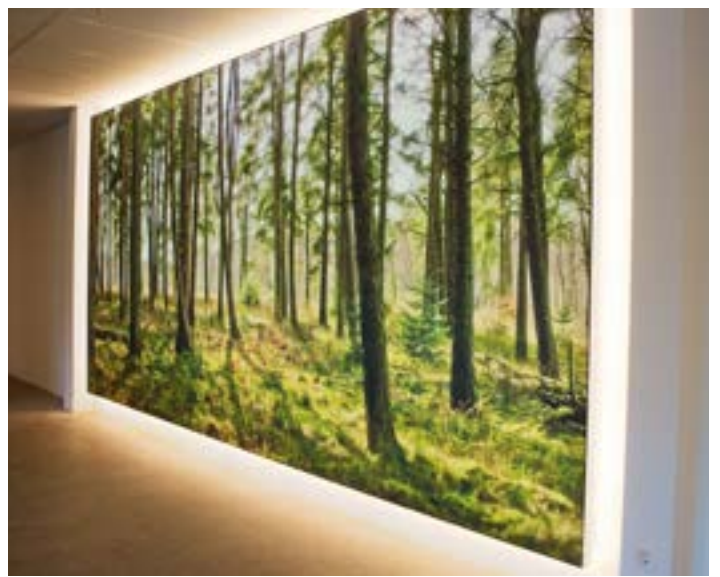
Wall box - Backlit printed covering - Belgium Application : City Outdoor

The compatibility of LED with our fabric gives you total customization: a printed coating with your choice of images or an artist's creation will create a unique atmosphere.