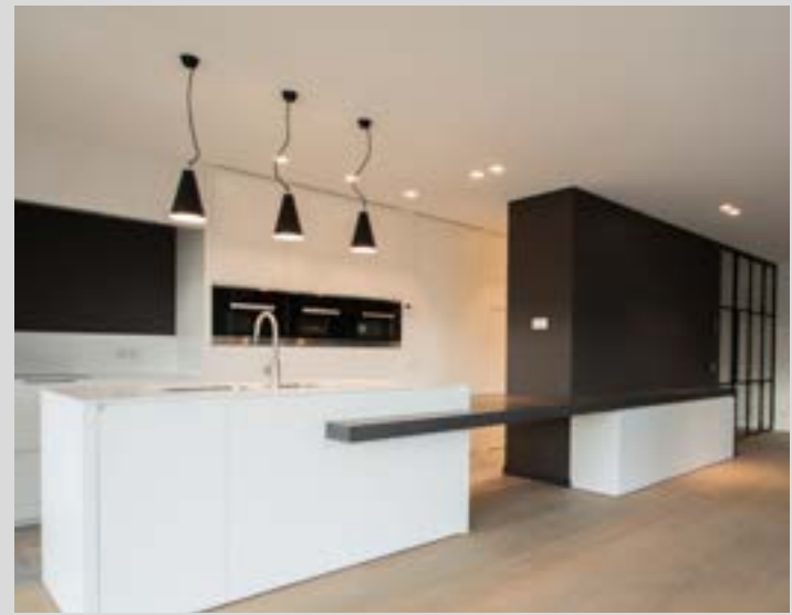
Private house - Acoustic ceiling with spots integration Belgium - Application : MONAVISA

Showcase your products in your stores and showrooms with modern and immaculate light.