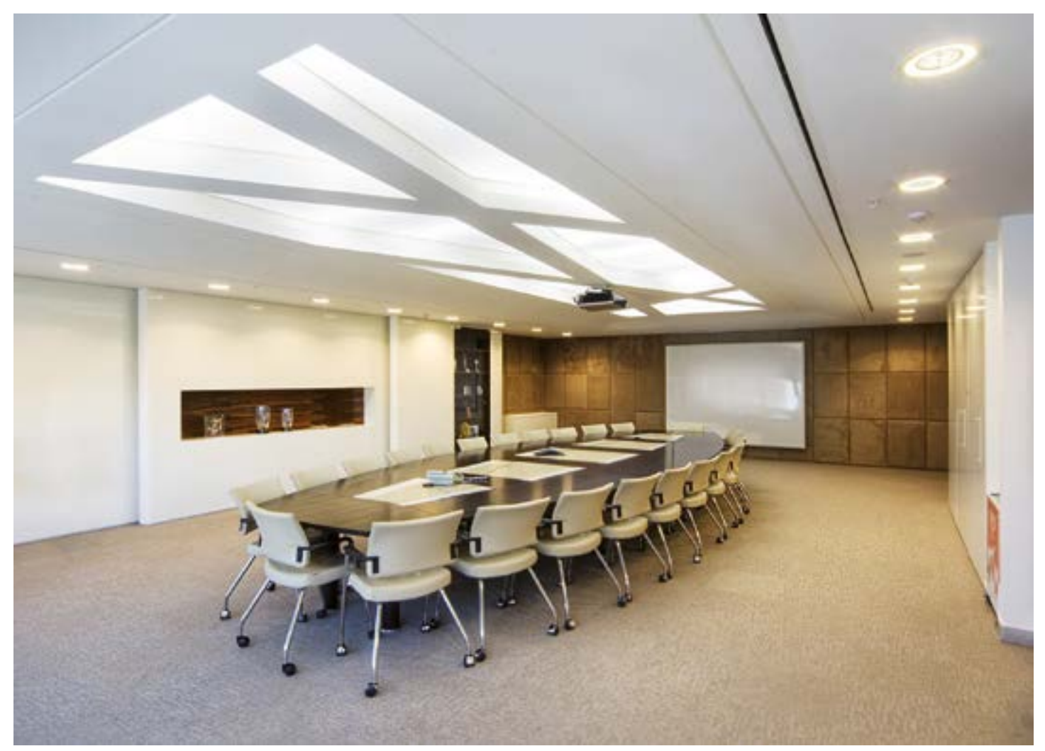
Meeting room UNILEVER - Ceiling and backlit structure